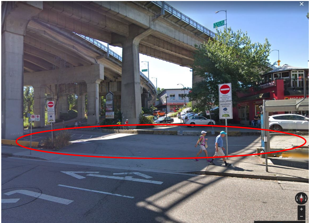
Figure 3. Street view of proposed site at 2 nd Avenue and Anderson. Available site area roughly indicated by circle. Currently already restricted to hop-on-hop off vehicles.