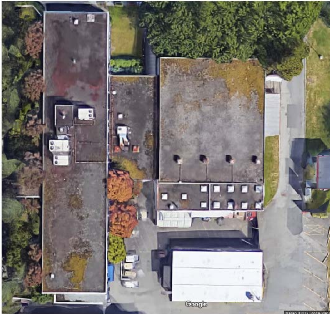
GENERAL SITE PLAN